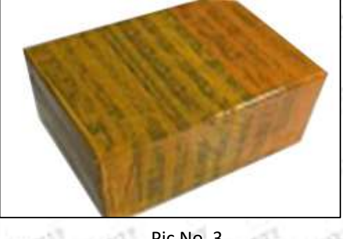
Pic No. 3 International express packaging: Wrapped with yellow tape after wrapping black protective film