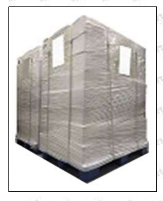
Pic No. 4

Pallet Shipping: Use pallet that meet export requirements, and use white wrapping protective film to wrap and bind with cable ties