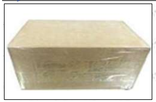
Pic No. 2 Domestic express packaging: Wrapped with Transparent tape